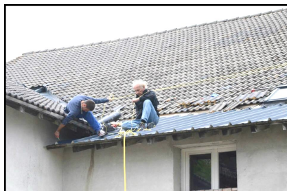
Although we do minister to the congregation in Marseille, our main worksite has been the Centre Bonnefoi, a Christian camp near Sainte Eulalie, France.

USA this year. In the last week, over $25,000 has been mailed out to cover our airfare, and all the supplies and materials that we will be using on this trip. Praise God! Most of our finances are already taken care of. However, your prayers on behalf of the mission team are coveted as we prepare for and embark on our trip.