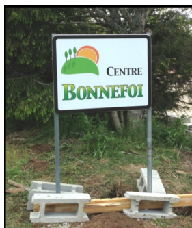
The new camp sign we installed in 2013.

We have a team of about 30 workers going from the