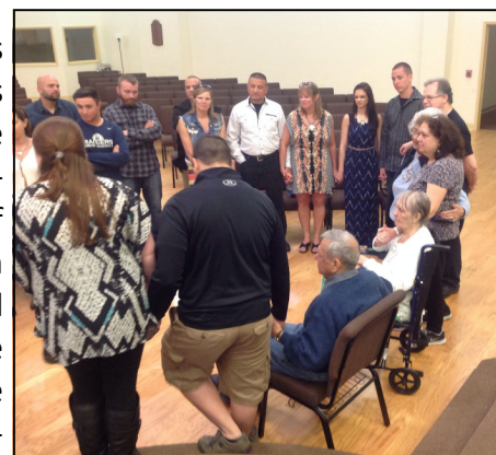
Above: Friends and family members rejoice in the "Love Circle" after the baptisms.