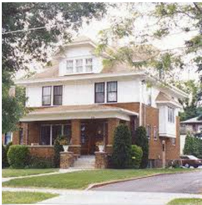
One of two Hands of Compassion hospitality houses offered by the Rochester Church of Christ.