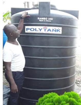
Water tank to be installed in back yard with house piping and electric pump