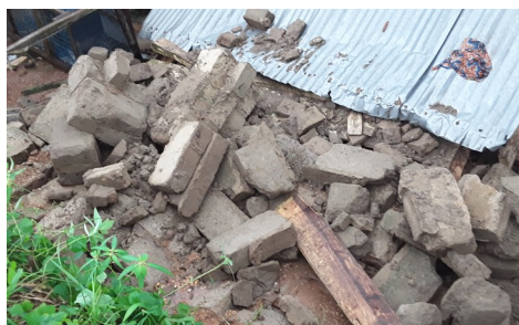
Collapsed retaining wall and toilet building

The photos are before and after repairs of the original damage, house repairs, and the installation of the well and high tank.