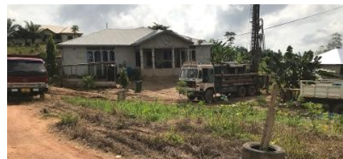
Front view of home and drilling