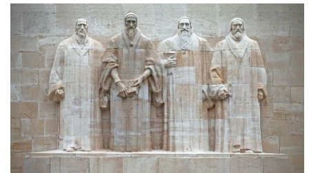
Center section of Reformation Wall in Geneva, Switzerland