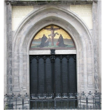
Memorial doorway in Wittenberg Cathedral