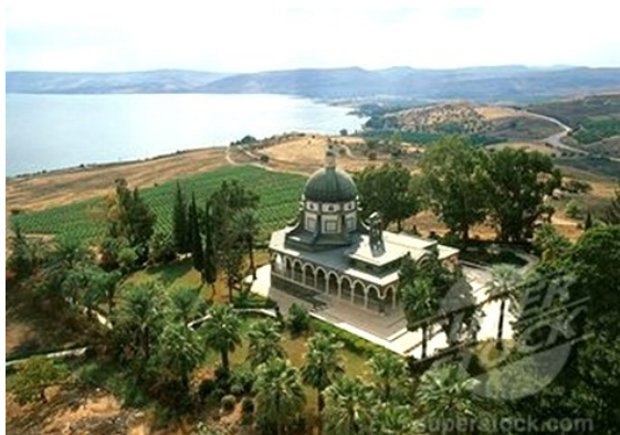
The Mount of Beatitudes in Israel, is the "traditional" site of Jesus' profound sermon, although not necessarily the exact site.