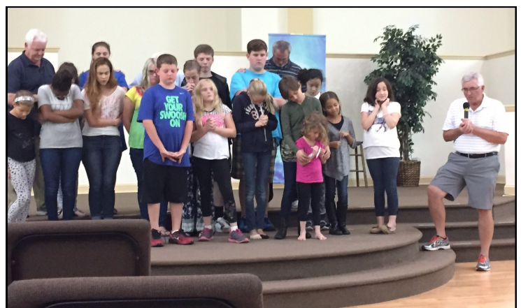
The elders pray over our students last Wednesday evening.

A chain of prayers and love was created for our students!