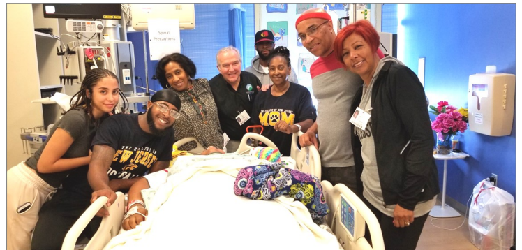
This is where we started...