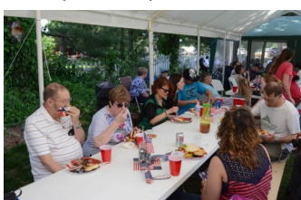
Walker's Annual Memorial Day Picnic