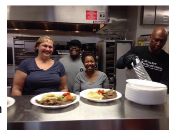
PRCOC members serve the homeless in Trenton