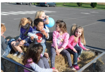
Fun Fall Festival