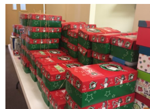
Operation Christmas Child