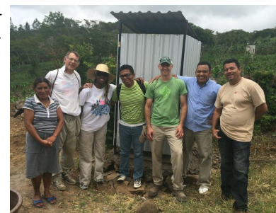
Mission Lazarus trip to Honduras with KOP church