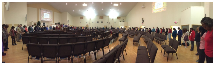
Autumn Fall Sing Along