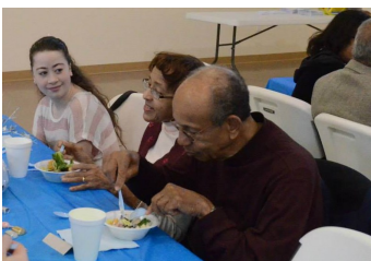
Senior Saints Dinner