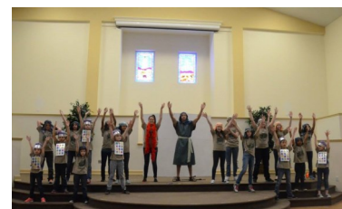
The cast of Break Down Our Walls