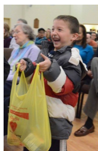
Pack the Pulpit