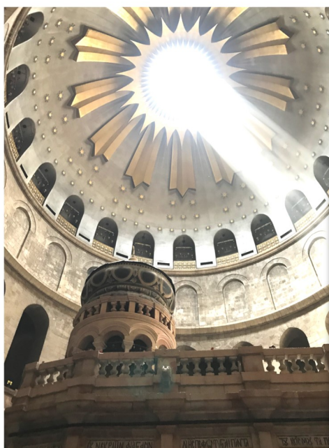
LEFT: Church of the Holy Sepulcher