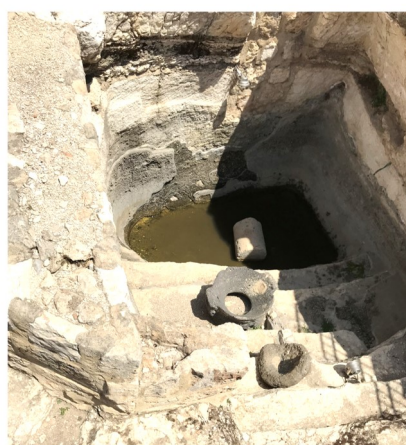
ABOVE: In Acts 2 following Peter and the other apostles sermon on the day of Pentecost, 3000 were baptized. It is very likely they were baptized in pools like these, called "Mikveh" located just outside the walls of the