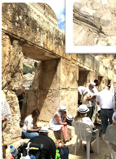
RIGHT: The likely site where moneychangers did their business just before people entered the Temple in Jerusalem.