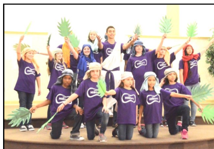
The cast of HIStory.

"Extravagant Giving" to the pizza delivery man. Fun Fall Festival hosted by teens. Trunk or Treat , inside the building due to bad weather.