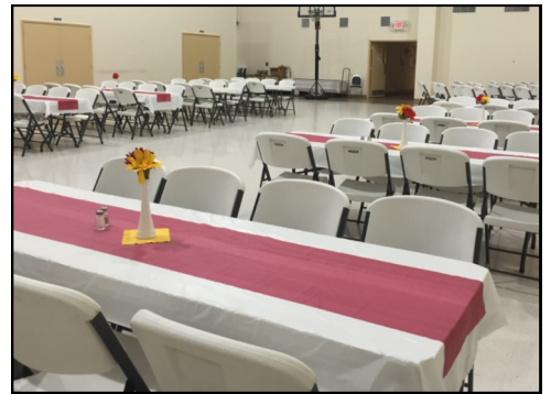
We couldn't get a photo of the three busy cooks, so here's the seasonal decorating they provided last Wednesday!